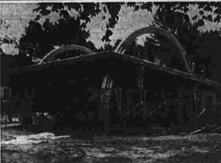
Bomb shelters? No, new businesses in modern design. Top picture is the new $125,000 McDonald's (hamburger chain) restaurant going up on the corner of W. Center and Cooper Sts.—a self-service restaurant specializing in America's favorite food, the hamburger. Below is a new $5,000, one-story, deacon style, self service dry cleaning business at the corner of Lilley and Main Sts. Both operations will open in the very near future.