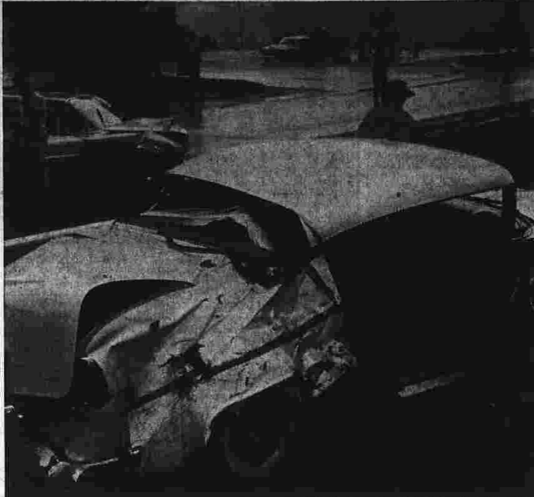
This car was hit broadside by the auto in the background after spinning on wet pavement and crossing the highway.